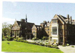
Homerton College, Cambridge

The aim is to create a campus of non-native English teachers from around the world. Milne commented, "A single campus location will create a lot of synergy, give lots of opportunity for